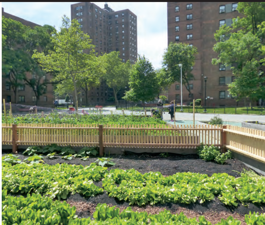
Urban farm at Wager Houses, New York City Housing Authority, New York, New York.

In 2016, Montgomery Parks instituted a pesticide reduction program in compliance with Montgomery County, Maryland's 2015 adoption of County Code 33B, which phases out the use of toxic pesticides on county-owned property, including parks, and on private property. In 2017, a Montgomery Circuit Court overturned the portion of the law pertaining to a ban on private